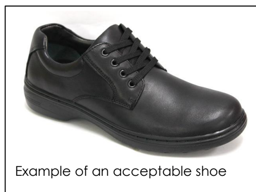
Example of an acceptable shoe

Clarks 'Detroit' are an acceptable shoe and are designed for orthotics. Boots are not acceptable.