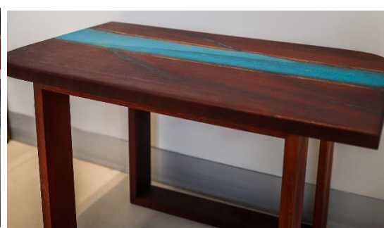
Woodwork & Metalwork Winner Coffee Table Brendan Naude