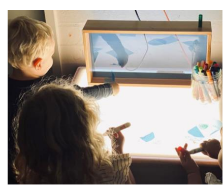
Theme 2022: Caring and Clarity - A Year of Growth and Resilience

It has been a remarkable year filled with growth, resilience, and a deep sense of care within our childcare community. Our theme, 'Caring and Clarity, guided us through the challenges and disruptions that came our way, reminding us of the importance of supporting one another and nurturing the clarity of purpose in our educational journey. Let's take a moment to reflect on the memorable events and achievements that defined our year.